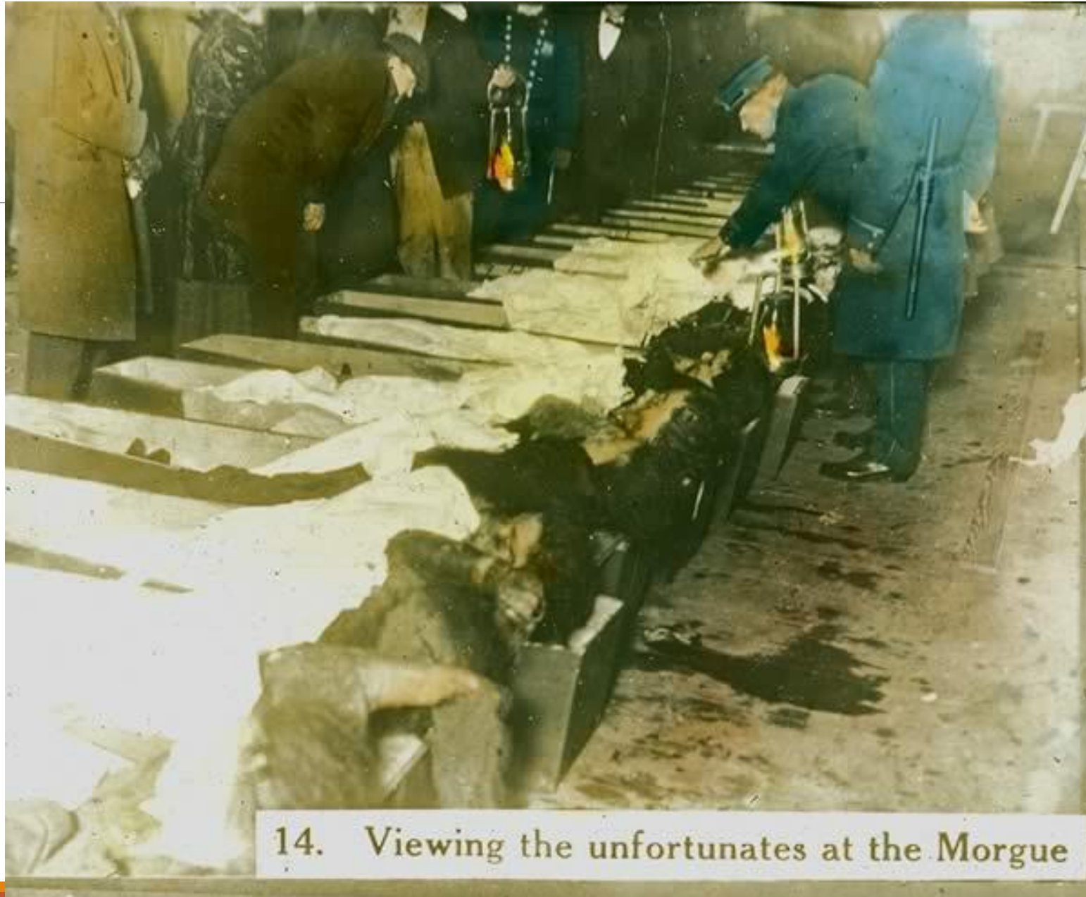
14. Viewing the unfortunates at the Morgue