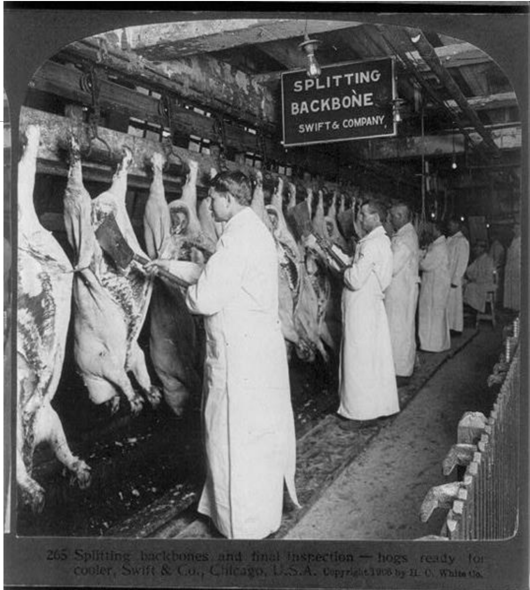
265 Splitting backbones and final inspection — hogs ready for cooler, Swift & Co., Chicago, U.S.A.